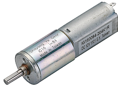
外形尺寸 APPEARANCE SIZE